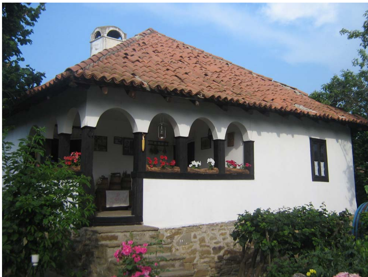
Fig. 1. Moravian house in the tourist offer of south Serbia.

Ajat is framed by segmental arched pillars. The kitchen is separated from the room in which it resides. Number of bedrooms depend on the number of families.