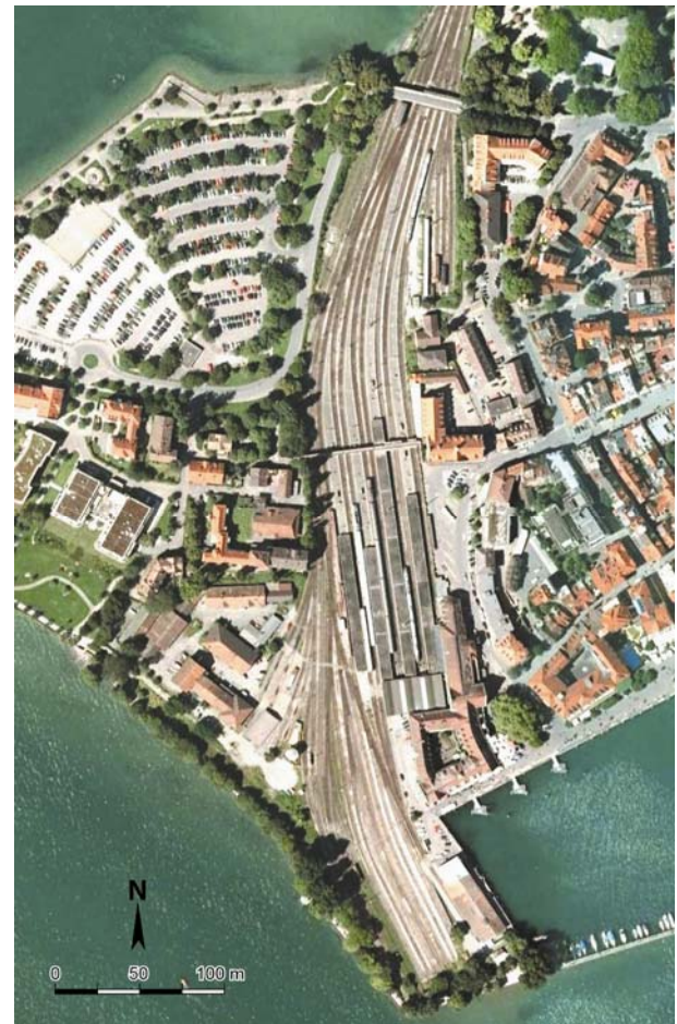
Fig. 4. Rail infrastructures as urbanistic divide between the historic city centre and the so called "Rear Island".

welcomed the initiative while others considered it an unacceptable violation of traditions to cut off the scenic train connection over the 500 meter long dam across the lake to the historic harbour of Lindau.