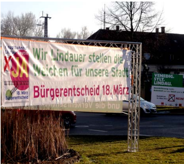
Fig. 6. Mega-sized campaigning banner of the citizens' initiative “Main Station Reutin”.

The citizens' initiative had successfully conquered public space and could not be neglected by the media any more. Communicative “terrains of resistance” [27] had been conquered within a short period of time, parting from the position of an outcast. The communicative battle culminated in media statements against the referendum by the Bavarian transport minister and deputy governor, the previous mayor who had just been voted out of office, the newly elected mayor and almost all parties represented in the city council of Lindau. A few days later, 53.13% of the citizens approved the citizens' initiative mainland train