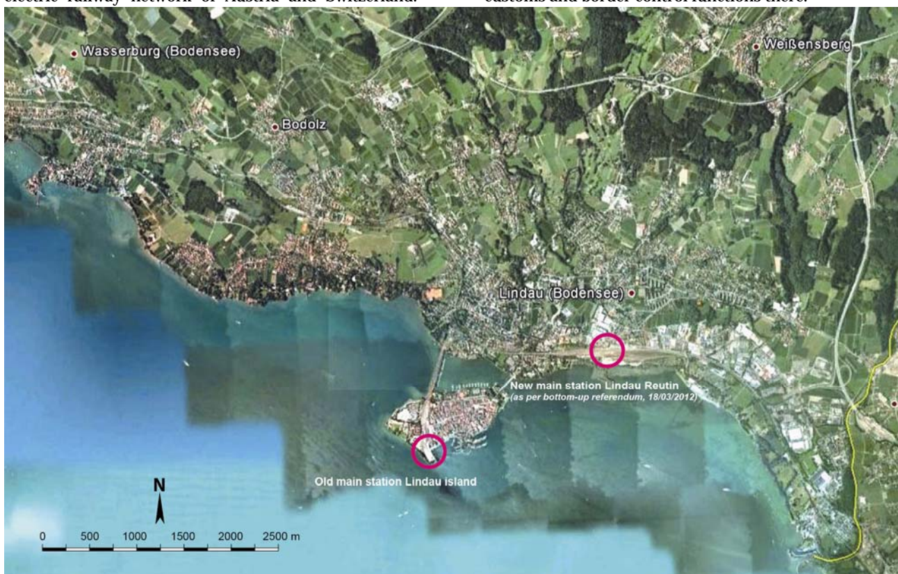
Fig. 3. Settlement structures in Lindau 2012 (source: Google Earth).

Trains going from Zurich to Munich still nowadays need to undergo a time consuming electric to diesel locomotive change in the dead-end station of Lindau as the city is surrounded by Germany's greatest non-electrified, backwardly diesel railway network. Before Austria had become a member of the European Union, it made sense to let all regional trains end in Lindau main station on the island, concentrating all customs and border control functions there.