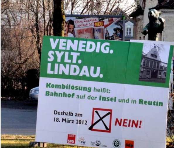
Fig. 5. Mega-sized campaigning poster sponsored by all parties opposing the bottom-up referendum.

[26]. The most important social media platform on Facebook which is also owned by the only local newspaper has been fed with arguments and verbal attacks against the citizens' initiative have been constantly countered with solid arguments. Information stands have been organised in front of commercial centres and on market squares.