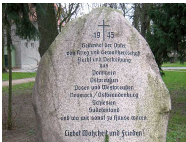
Fig. 2. A commemoration stone for expellees on the German side of the border.

In a similar vein, another actor deeply involved in cross-border projects said “one goal is to reconstruct the old infrastructure such as the Berlin-Świnoujście railway, which once took two hours to travel”. He also referred to a report on an integrated transport plan for Usedom and the Polish island of Wolin [21], financed by Germany’s Federal Ministry of Transport, Building and Urban Development. According to a representative of another town, “Szczecin is still the capital of Pomerania, although not formally”. He told us the local expellee commemoration stone is a private initiative to promote cooperation with the present population of formerly German areas. While this motivation might have been present, the stone actually commemorates expellees from formerly German territories only (see Figure 2), rather than for instance all victims of the post-war expulsions, including Poles.