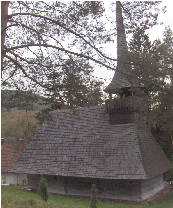
Fig. 2. Wooden Church.

Of a great value is the Wooden Church from Ciucea. In 1941, Veturia Goga, Octavian Goga's wife, brings the Gălpaia church from Sălaj - church monument dating from 1575 - and builds it on the property of Goga family near the "monastery" building. In some places, there are still fragments of paintings on canvas that were dusted inside the church. Unfortunately, during communism the paint was almost completely taken off the walls.