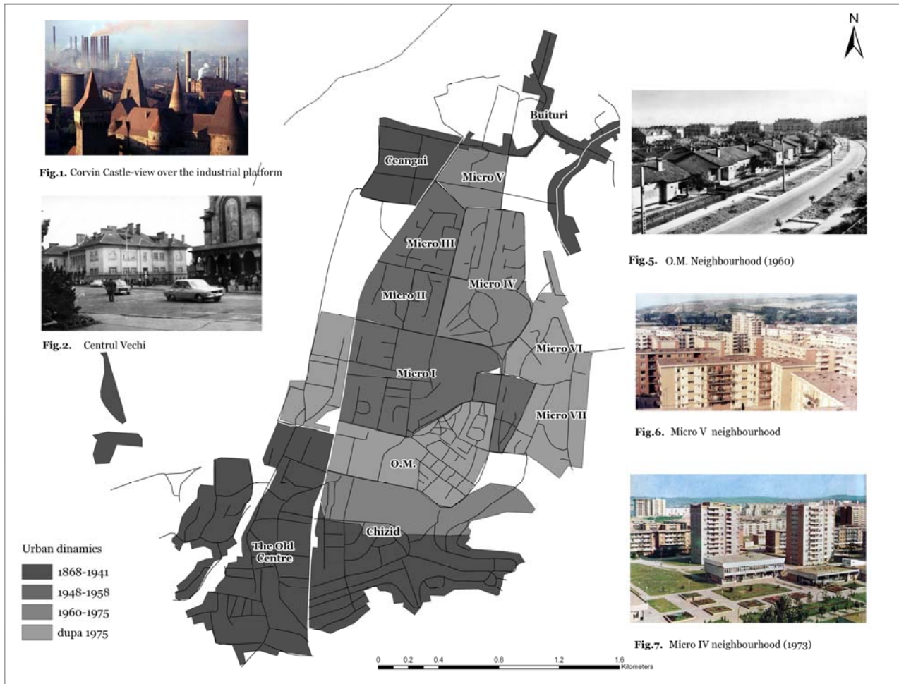
Fig. 2. Urbanization stages in Hunedoara city.

After the end of the “great” urban systematization in 1975 a spatial model concerning the location for different functional areas and redefining the functions for older areas, is starting to be outlined.