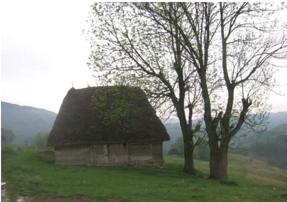
Fig. 2. Wooden house model from Apuseni Mountains (foto: Nemes Loredana Mihaela, 2007).

The period after 1989 marked a new period in rural development. Extensive programs like conversion of labour, agro-tourism development and upgrading utilities will be discussed in Parliament in our country like international programs. We hope that soon the so-called "Tara Moților" will be capitalized in all respects to its fair value.