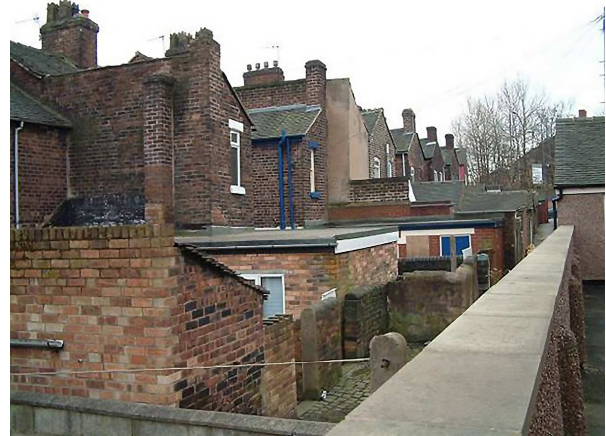
Fig. 3. Victorian terraced houses made of red bricks are a common feature in Stoke.

Because of the structure of the mining and pottery industry in the region, and the meagre salaries paid by the ceramics industry, there were not a lot of middle class households and the social make-up of the six towns was mainly composed by poorly paid industrial workers who often faced work instability. They were mostly lodged in single-walled Victorian terraced houses. This has left a legacy of poor housing stock, "unfit for the 21 st century" , which is difficult and expensive to bring to modern standards of energy efficiency [6].