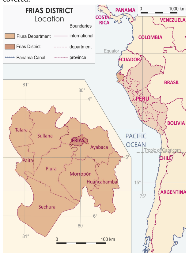
Fig. 1. Localization of the Frias District.

Environmental conditions are also such that this is a biodiverse area even by South American standards, in which conditions also favour the cultivation of a great many tropical crop plants. Within the overall area of the district equal to 47,800 ha, there are some 18,700 ha under cultivation. However, only around half (8,200 ha) of the arable land here is irrigated, which means that the dry season can be associated with shortages of water – to the extent that irrigation is a must if efficiency and output in farming are to be raised. Some 22,400 ha of land comprises pasture, this being an important element where the development of livestock (mainly dairy-cattle) raising is concerned. Just 3,400 ha of the district remains forest-covered.