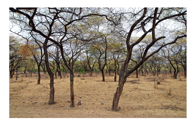
Fig. 3. Landscape of Costa.

this being the exceptional diversity of cultivation in structural terms.