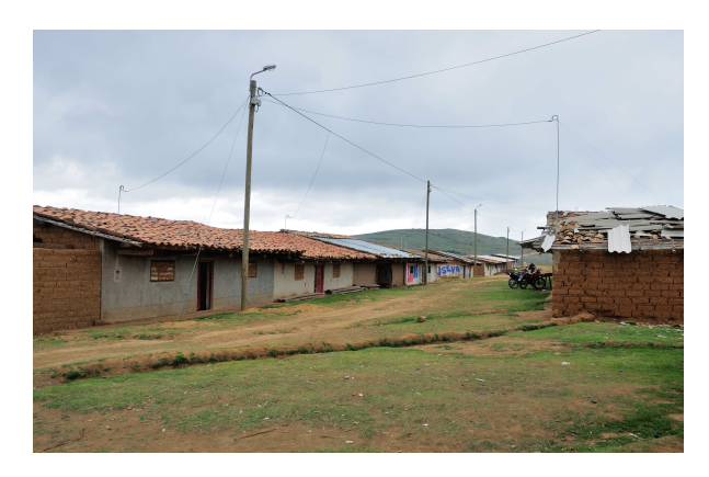
Fig. 8. Paramo landscape.

Thus, the economic base in Frías district comprises crop-growing and livestock rearing, with the latter mostly supplementing the former, and with a wide diversity of crops (first and foremost food crops) grown with a view to famers meeting the needs of their own families. The corollary of this is the very limited commercialisation of crop-growing, and a failure of local producers to compete in any way for the urban (e.g. Piura or Lima) markets, against the farmers operating along the coast. Means and techniques of cultivation are traditional, verging on primitive, and this fact combines with the prevalence of food crops to obstruct the development of agriculture, notwithstanding relatively