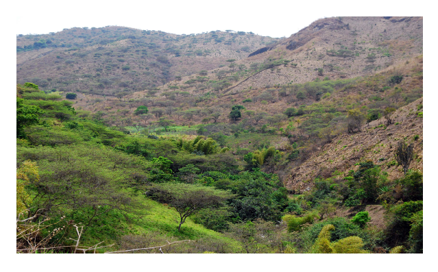
Fig. 6. Landscape of Quechua.