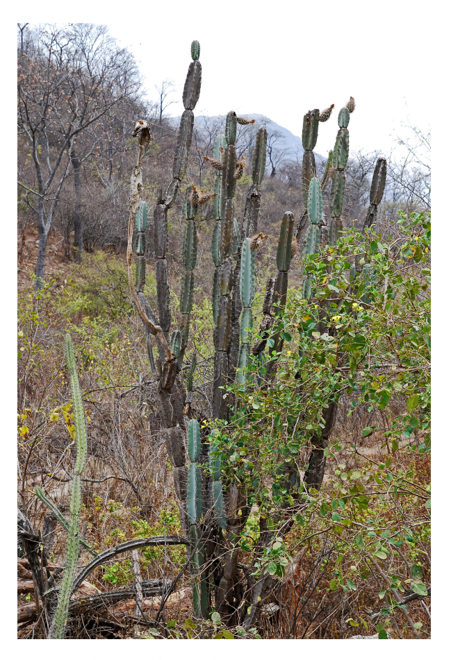
Fig. 7. Landscape of Yunga.