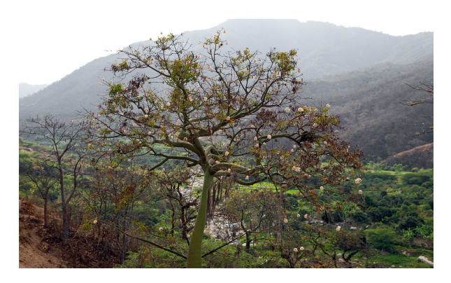
Fig. 5. Landscape of Quechua.