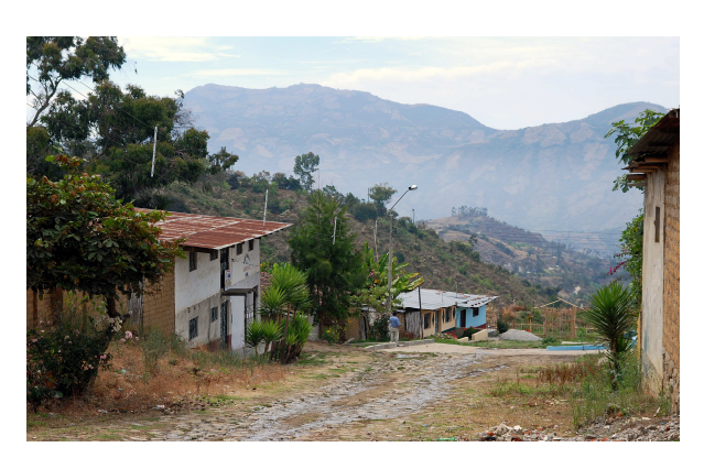
Fig. 4. Landscape of Quechua.