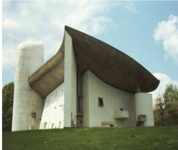
Fig. 5. Notre Dam Cathedral, Ronchamp, France [25].