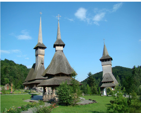
Fig. 9. Traditional wood architecture in Maramureș region. Bârsana monastery, Romania.