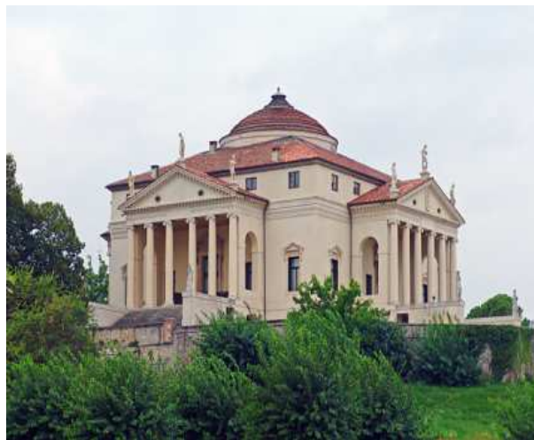
Fig. 4. Villa Capra (“La Rotonda”) Vicenza, Italia [24].