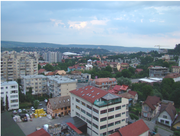
Fig. 19. Urban chaos in Cluj-Napoca, Romania (2013).

buildings are inserted, dominated by firmitas dimension with role of figuration (e.g. banks or corporate headquarters), in clear dissonance with the rest of the buildings, eventually affecting the historical townscape. However, more damaging than the physiognomy of cities is when the functional zoning and urban regulations make no clear distinction between sites designed for the implementation and development of architectural patterns, a situation leading to the emergence of an urban amalgam generically called urban chaos by Pierre von Meiss (2012) [12, p.61] (see fig. 19).