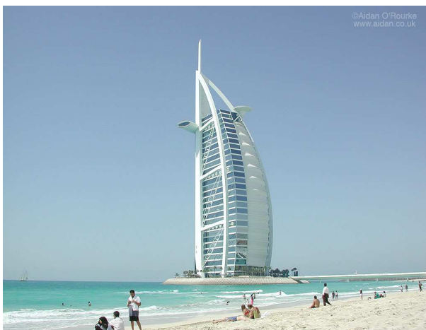
Fig. 3. Burj al Arab Hotel in Dubai – high-tech architecture in tourism [23].