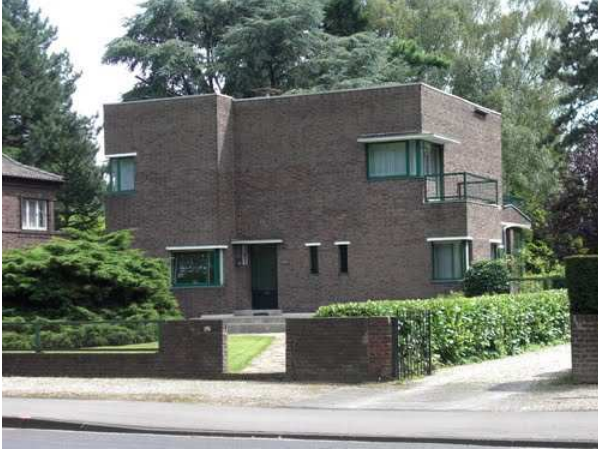
Fig. 16. Bauhaus Architecture by Ludwig Mies van der Rohe in Bockum, Krefeld [35].

ordinary citizen, although even from the start it actually aims to “mass production” and “consumer goods”, but manages to make the leap, the revolution by producing valuable architecture instead of famous “workers neighbourhoods” found during the British industrialization [11].