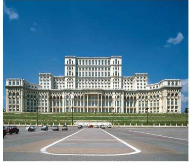
Fig. 10. Palace of the parliament, Bucharest, Romania [29].