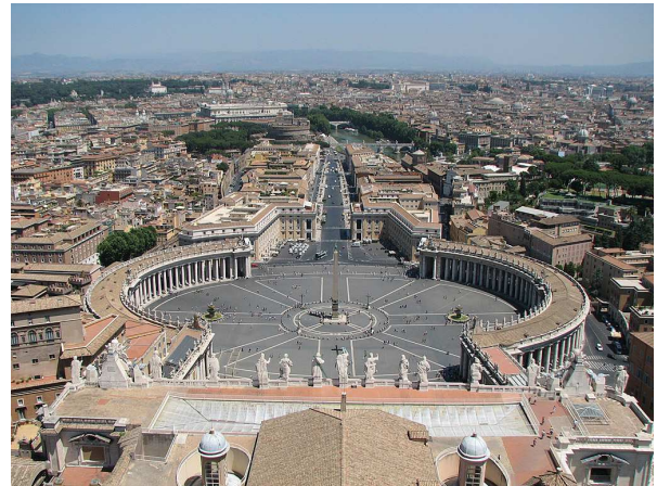
Fig. 14. Saint Peter's Square in Vatican [33].

geometric shapes (circle, square, rectangle, triangle, etc.) tailored to the needs of human habitation.