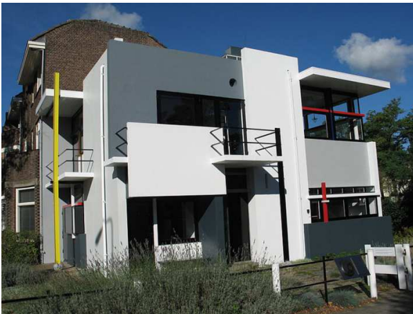
Fig. 17. The Rietveld Schröder House, 1924 [36].

The aesthetic models are derived from doctrines or programs that rely on a number of trends established by architects or artists. The most significant is the neoplasticism, a style of abstract painting proposing the decomposition of reality essence into fine elementary structures (simple) made up of lines, surfaces, primary colours and non-colours. A representative example is the architect Gerrit Thomas Rietveld whose architecture is based on the principle of decomposition into volume and surface lines (primary elements).