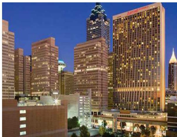
Fig. 6. Marriot Marquis Hotel, Atlanta, SUA [26].