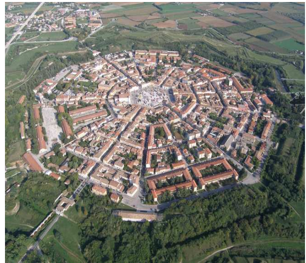
Fig. 18. Palma Nuova city, Italy, built after a concentric layering in radial geometry [37].

As the city is the economic, functional and cultural expression of the region it polarizes, the physiognomy of a city is the expression of architecture embedded within it. The combination of coherent architectural patterns with internal plotting, harmoniously and geometrically designed and integrated in an appropriate natural setting, always generates attractive physiognomies adapted for the human needs (see fig. 18).