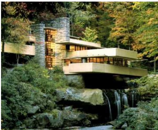
Fig. 1. Frank Lloyd Wright - one of his architectural artworks – personal house [21].