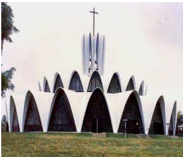
Fig. 2. St. Mary's cathedral, San Francisco, USA [22].