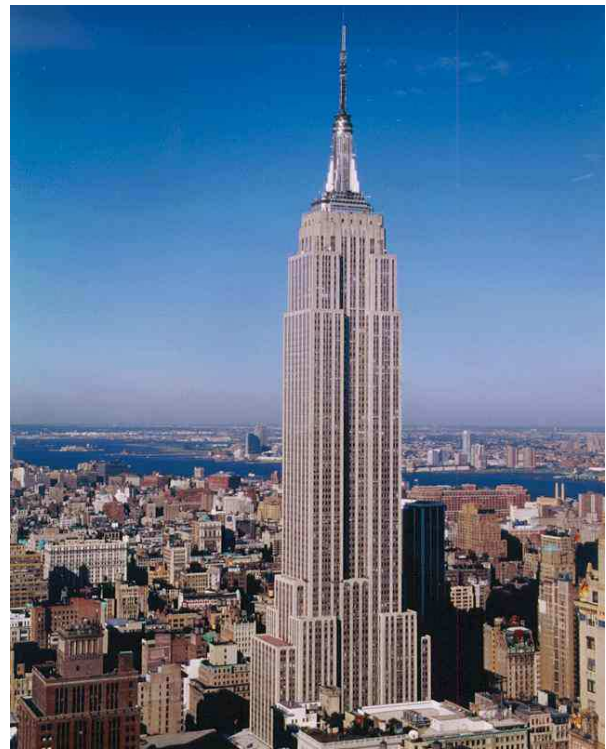
Fig. 15. Empire State Building in New York, USA the expression of the new economic power [34].

These forms are used both in shaping the overall plan of the settlement and for the internal spatial allotment on which construction and buildings are designed.