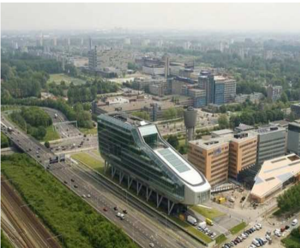
Fig. 8. ING headquarters in Amsterdam, the Netherlands [28].