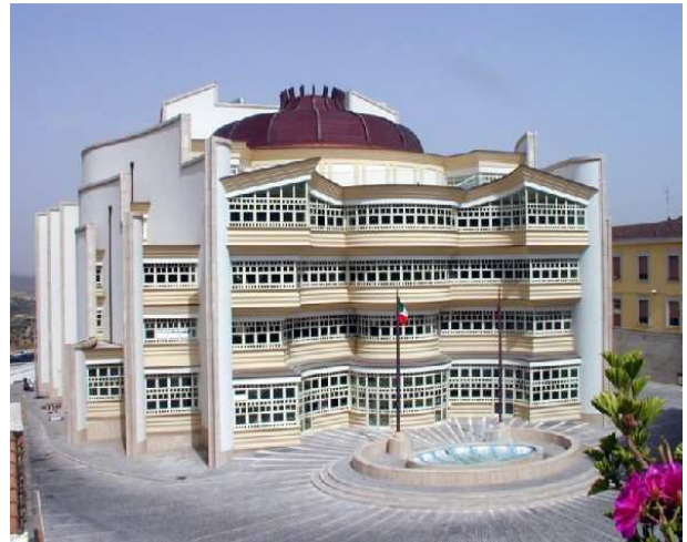
Fig. 12. Politeama Theatre in Catanzaro, Italy [31].