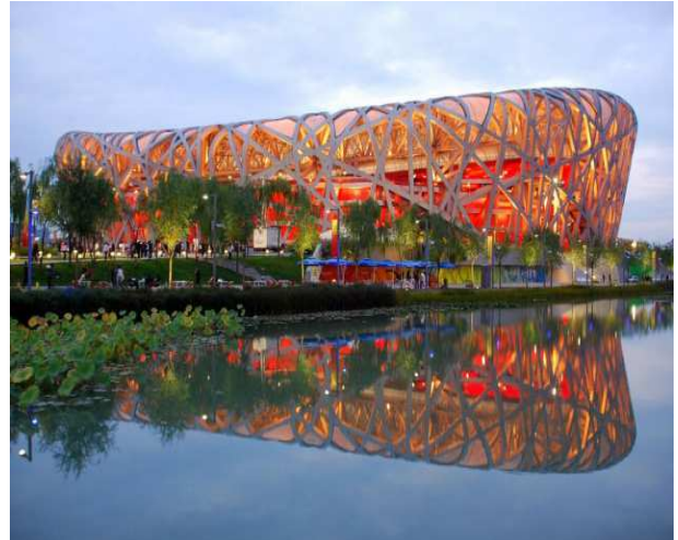
Fig. 11. The Olympic Stadium Bird's Nest, Beijing, China [30].