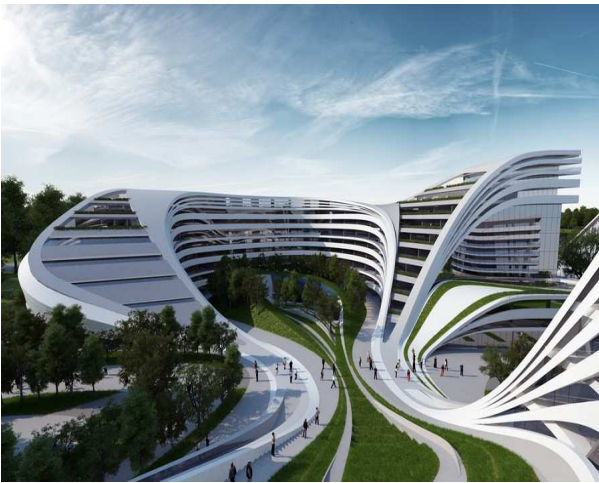
Fig. 22. Bako Masterplan Belgrade – urban regeneration [39].