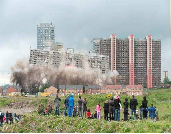
Fig. 21. Regeneration scheme by demolishing multi-storey blocks of flats in Glasgow [38].

openness of space, interpreted by Hilde Heynen (1999) and stating that houses should not look like fortresses; rather, they should allow for a life that requires plenty of light and wants everything to be spacious and flexible. Houses should be open; they should reflect the contemporary mentality that perceives all aspects of life as interpenetrating [13, p. 36].