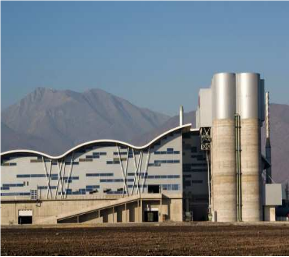
Fig. 7. Industrial plant, Chile [27].