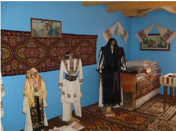
Fig. 4. A. The Gurghiu Valley Festival; B. Traditional costumes from Ibǎneşti.