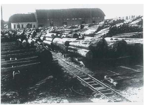
Fig. 2 A, B. Wood exploitation at Lăpușna .