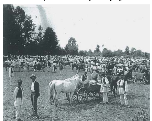
Fig. 3. Animal Fair on St. Gheorghe Holiday, in Gurghiu.

Nowdays, the sheep breeding has become the main activity in small farms in the villages of Caşva, Hodac, Ibăneşti and Ibăneşti Pădure with the help of some associations for agriculture. If in the past the dairy products were produced by the peasants for their daily use, nowadays those products are commercialized outside the limits of the basin, and the trade is increasing; in this respect the remarkable production activity of the private cheese factory in Ibăneşti is to be mentioned. Besides ovine breeding, beekeeping has become a new occupation in the last decades, and the trade with honey has made an important progress.