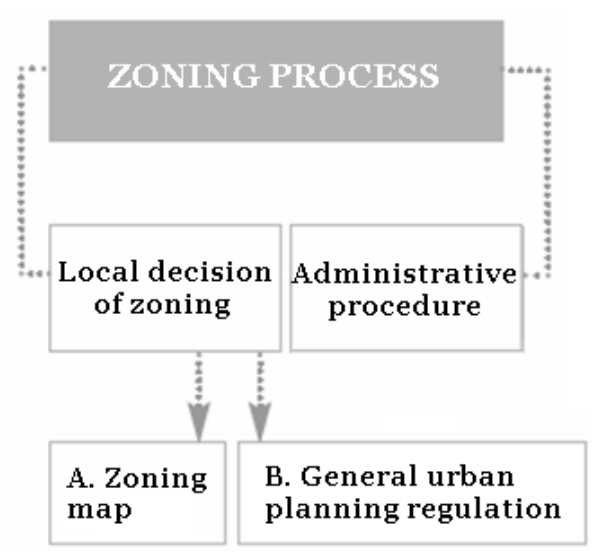
Fig. 1. The scheme of the zoning process [3, p. 11].

However, the Local Urban Planning Regulation annexed/appended to the zoning plan specifies the restrictions to be applied in each designated zone as well as the general information for their management. The administrative procedure consists in the approval/change of the provisions of the Local Urban Planning Regulation regarding consistent and inconsistent cases or on the structure of any Regulation's decision.