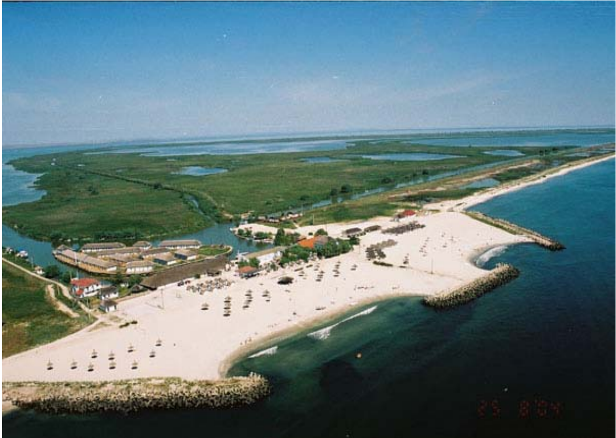
Fig. 4. “Gura Portiței” holiday village, Tulcea County, Romania [17].

Most of “holiday villages” in Romania only partially comply with the standards imposed by this concept. They rather represent attempts that consist of a combination of lodging and dining facilities, yet without including other recreational and leisure facilities, not even mentioning their theme and style. This way, it is necessary to further promote this concept so as to become a working tool for the sustainable development of the future “holiday villages”.