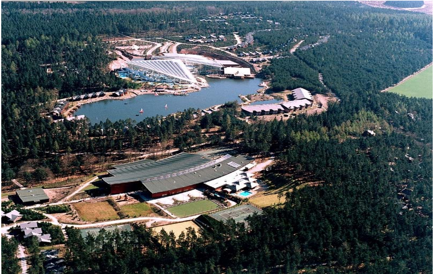
Fig. 1. Oasis Whinfel Holiday Village, UK. [5]

presupposes adequate sanitation, solid waste disposal and waste water treatment [2, p. 250], whilst maintaining their functionality is more laborious and expensive [3, p. 62]. Space-intensive user, for lodging and recreation, as well as for cultural and sports purposes, “holiday villages” are mostly oriented towards the social clientele (elderly, children) or the commercial category of high-income tourists from urban areas [4, p. 105].