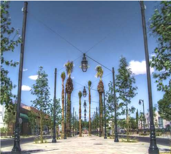
Fig. 1. Main Street of Lancaster, California, after conversion.

to the street, rather than traditional 'Euclidean' zoning that segregates land uses from each other [1]. An architecture and planning firm was also employed to turn the fortune around for the battered main street and attract business and people back to the downtown. What they created was a boulevard (named THE BLVD), whose key elements include wider, pedestrian-friendly sidewalks, arcades, outdoor dining, single travel lanes, enhanced zebra crossings, additional trees, thus better shading, added lighting, gateways and public art.