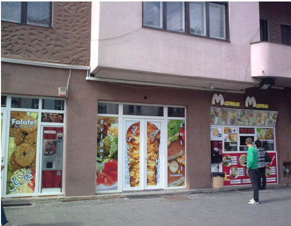
Fig. 3. Example of a 'clone' space on Eroilor Boulevard, Cluj-Napoca, in 2011.