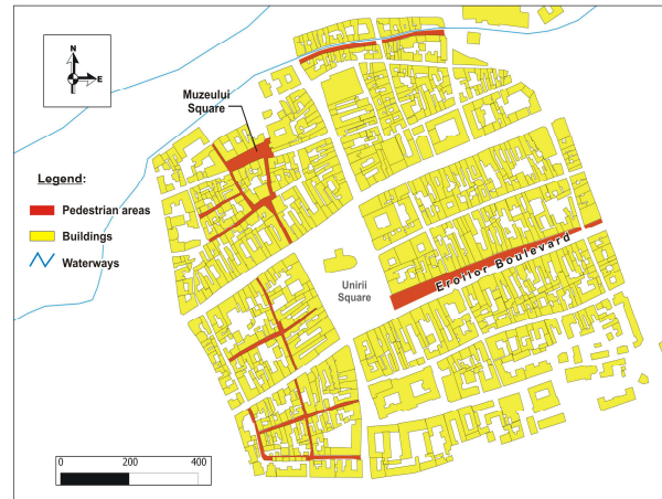
Fig. 2. The pedestrian areas of Cluj-Napoca's old town in 2012.

The above mentioned phenomena are entangled in a 'conflict', the stake being the retail base and the people of the city. The battle is not over, but the question remains, who is winning? Did the pedestrian area and the city centre attain their goal and recover their former glory? Can pedestrianisation be used as a universal economic (re)development tool?