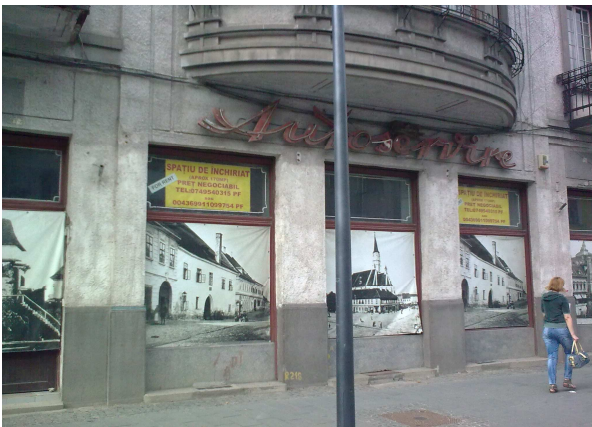
Fig. 4. Example of a 'ghost' space on Eroilor Boulevard, Cluj-Napoca, in 2011.

Alongside 'cloning', the existence of ghost (empty) streets and spaces is one of the best indicators for an area's economic turmoil. In the case of Cluj-Napoca, this phenomenon, a manifestation of the recent retail flight towards shopping malls and downtown ruin, is highly evident on Eroilor Boulevard, but also on other pedestrian streets, such as Andrei Șaguna. However, I will again point out Eroilor Boulevard as an example for this process, as it has the largest retail surface area, the most significant number of 'ghost' spaces and was pedestrianized in 2007, thus offering the best perspective on the pedestrianization-economic dynamics relation.