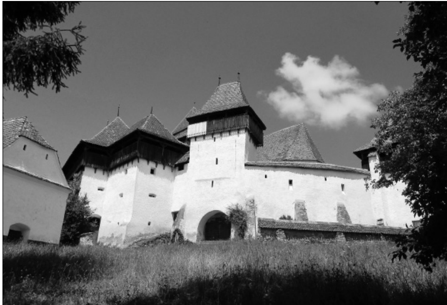
Figure 3 Saxon fortified church in Viscri/Deutschweiskirch

Its touristic potential compared to the other two Romanian villages is medium, with the main asset of a very traditional and unspoiled villagescape. A second advantage is its location in a remote and silent area; a third its truly Saxon character, which manifests itself in many ways: the architecture and the setting of farmsteads, furnishing and a prestigious Saxon fortified church.