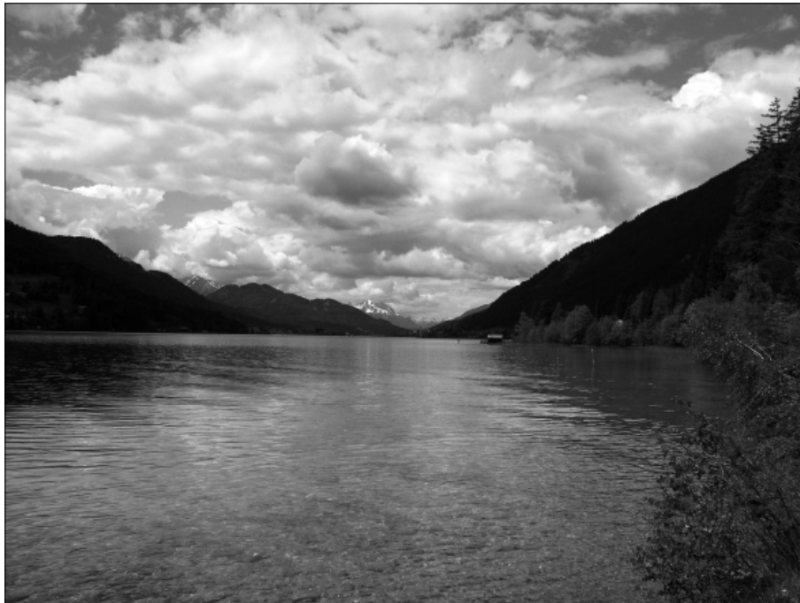
Figure 6 Lake Weißensee in the Gailtal Alps