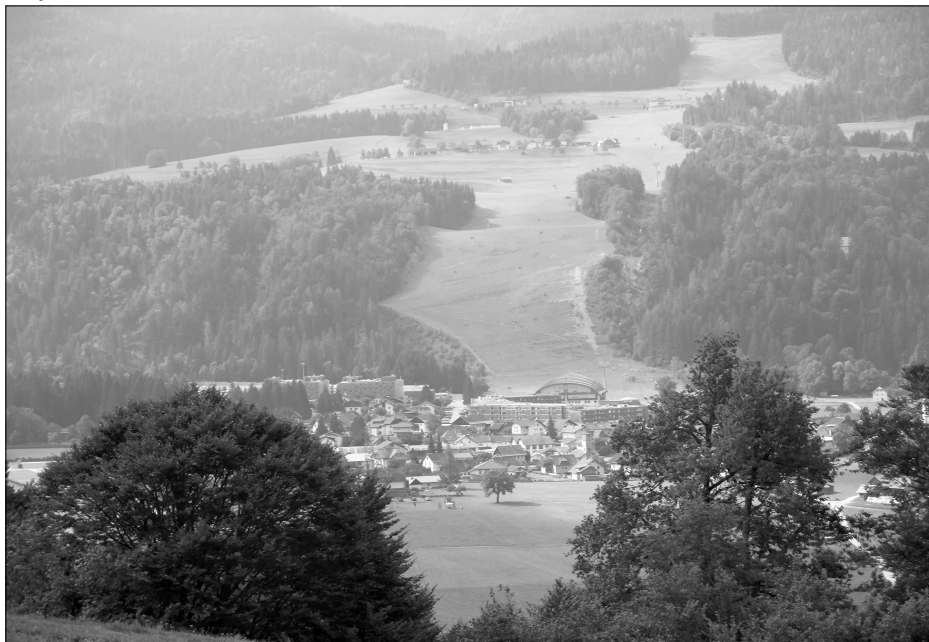
Figure 5 Tröpolach with its cable-car station