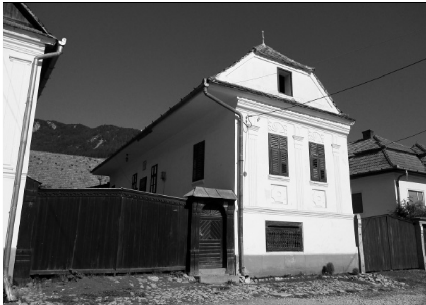
Figure 2 Traditional house in Rimetea/Torockó

Its touristic potential, compared to the other two Romanian villages, is very likely the strongest due to an appealing villagescape (Figure 2), its embeddedness into a nice natural mountainous setting and its obviously active and tourism-minded population. The quality of its current touristic offer meets Central European standards. It looks attractive not only for leisure tourists, but due to the mining history of the place, the well maintained vernacular architecture, the museum and private ethnographical collections also for historically/culturally interested persons, i.e. not only for young families with children, but also for cultural tourists in the narrower sense. Due to its location, the village is interesting also for nature and hiking lovers and suitable for extreme sport, such as paragliding. Its good accessibility extends the activity radius of the guest to the larger towns and cities in the surroundings. Although larger groups of tourists are nowadays coming from Poland or the Baltic states, the current touristic demand is obviously still focused on the Hungarian market, to which the village has special relations due to its distinct Hungarian past and still a remarkable share of Hungarian population.