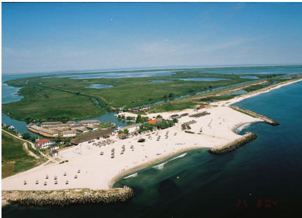
Fig. 4. “Gura Portiței” holiday village, Tulcea County, Romania [17].

Most of “holiday villages” in Romania only partially comply with the standards imposed by this concept. They rather represent attempts that consist of a combination of lodging and dining facilities, yet without including other recreational and leisure facilities, not even mentioning their theme and style. This way, it is necessary to further promote this concept so as to become a working tool for the sustainable development of the future “holiday villages”.