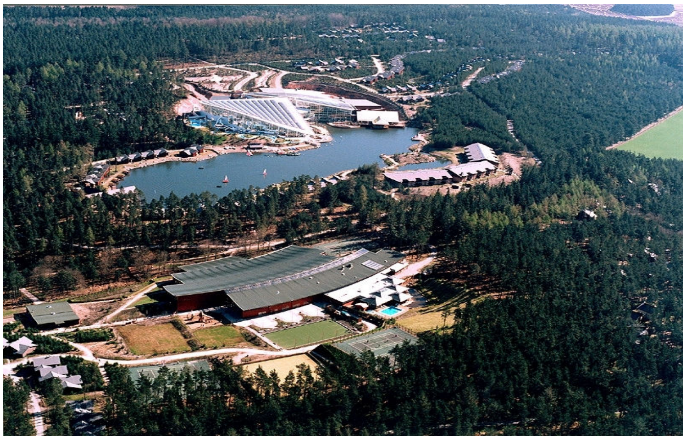
Fig. 1. Oasis Whinfel Holiday Village, UK. [5]

presupposes adequate sanitation, solid waste disposal and waste water treatment [2, p. 250], whilst maintaining their functionality is more laborious and expensive [3, p. 62]. Space-intensive user, for lodging and recreation, as well as for cultural and sports purposes, “holiday villages” are mostly oriented towards the social clientele (elderly, children) or the commercial category of high-income tourists from urban areas [4, p. 105].